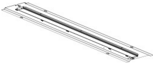
For GRX3 LED KIT 1200 mm (3700 & 5000 lm)