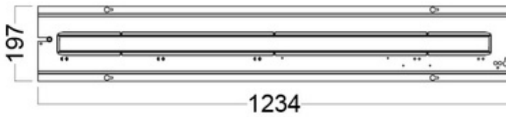
for GRX3 LED KIT 1200 mm (3700 & 5000 lm)