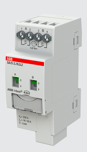
ABB i-bus® KNX SA/S 2.16.5.2 Switch Actuator