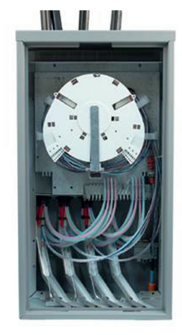
Fully equipped cabinet with additional splice trays and micro cable strain reliefs (ordered separately)