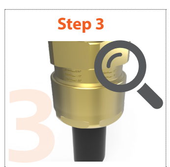
The backnut should be level with the marking guide corresponding to its diameter – this can be visually inspected and adjusted as necessary

Note: The cable gland installation instructions have a printed cable OD measure for if the cable OD is not known