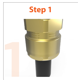
Follow cable gland installation instructions until final stage – tightening of rear seal

The gland is permanently marked with various lines/numbers indicating the correct tightening level related to the cable diameter. Following the relevant cable gland Installation Instructions, the back seal should be tightened until a seal is formed on the cable outer sheath and then tightened one further turn.