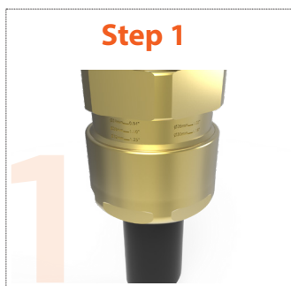
Step 1 Follow cable gland installation instructions until final stage – tightening of rear seal

The gland is permanently marked with various lines/numbers indicating the correct tightening level related to the cable diameter. Following the relevant cable gland Installation Instructions, the back seal should be tightened until a seal is formed on the cable outer sheath and then tightened one further turn.