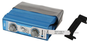
Wedge 120 galv ES