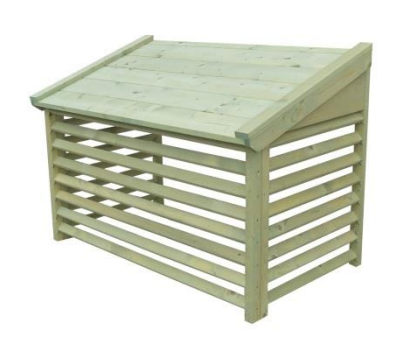
Inside dimensions: 520 x 940 x 620-760 mm (D x W x h-H)

Fact # 18: dimensions and design can be adjusted according customer's needs