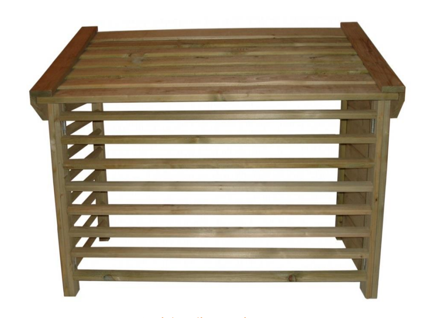
Inside dimensions: 520 x 940 x 620-760 mm (D x W x h-H)