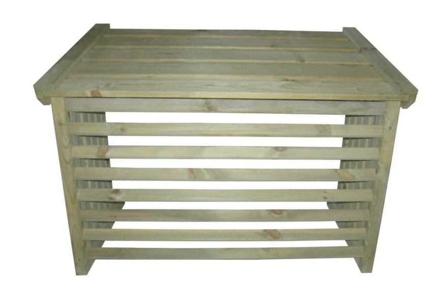
Inside dimensions: 520 x 940 x 620-760 mm (D x W x h-H)