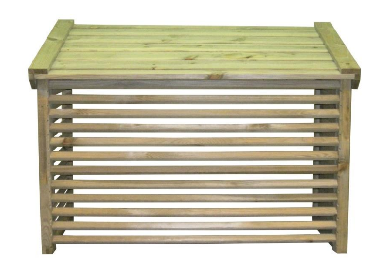
Inside dimensions: 520 x 940 x 620-760 mm (D x W x h-H)