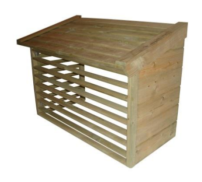
Inside dimensions: 520 x 940 x 620-760 mm (D \times W \times h-H)

Fact # 18: dimensions and design can be adjusted according customer's needs