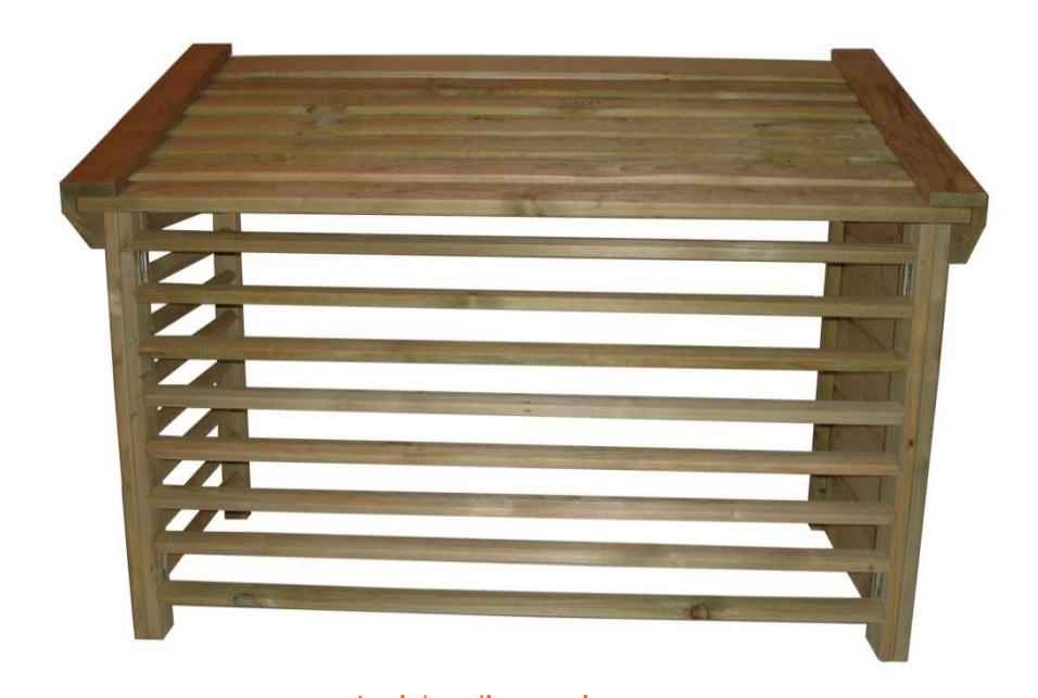
Inside dimensions: 520 x 1055 x 620-760 mm (D x W x h-H)