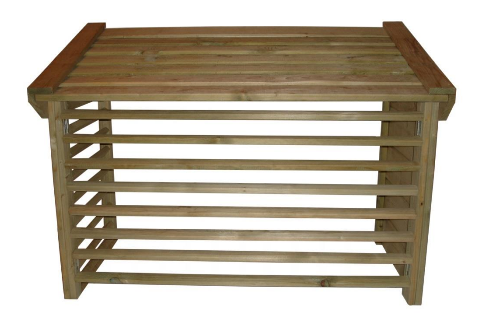
Inside dimensions: 520+50 x 1055 x 620-760 mm (D+d x W x h-H)