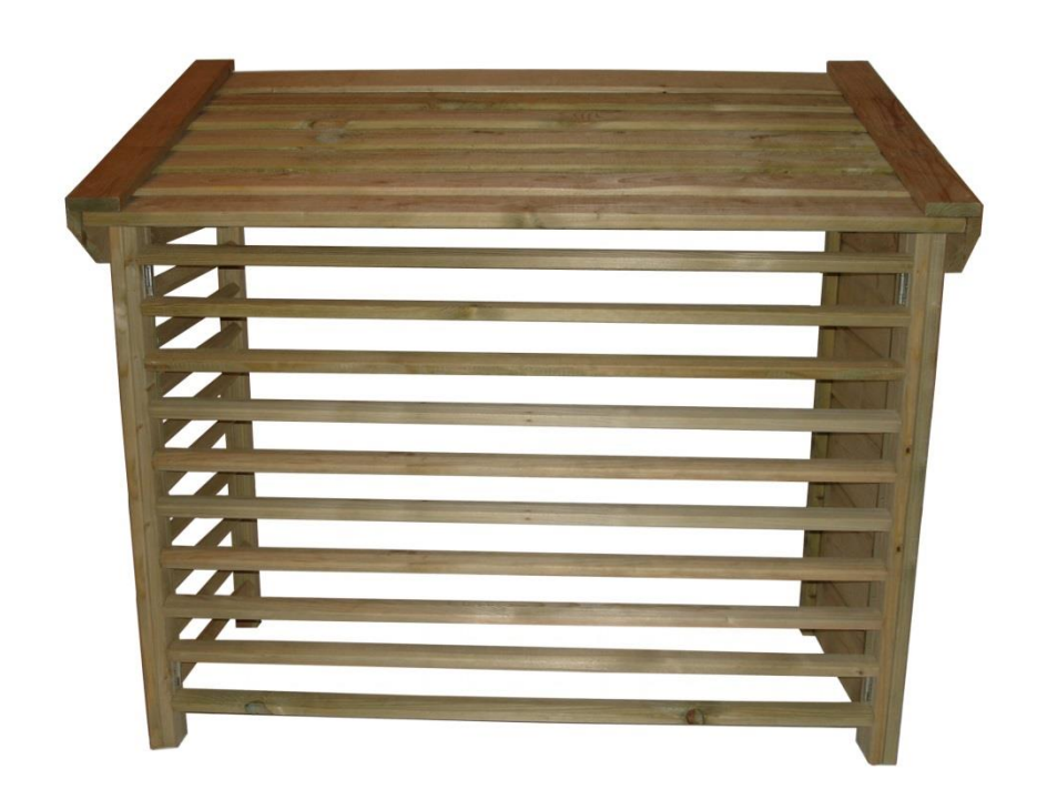
Inside dimensions: 520 x 1055 x 760-900 mm (D x W x h-H)