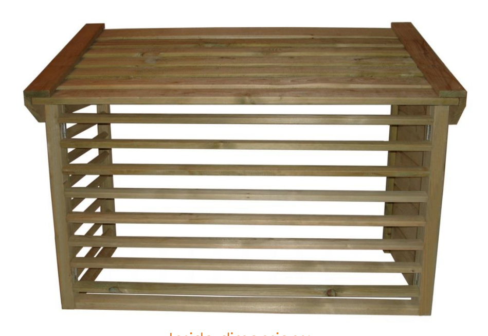
Inside dimensions: 520 x 1055 x 620-760 mm (D x W x h-H)