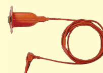
7168A Line probe with alligator clip(3m)