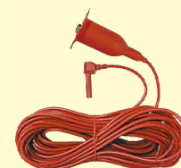
7253 Longer line probe with alligator clip(15m)